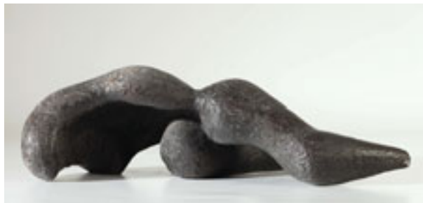
Olga Jančić, Fall , 1957, bronze, 19 x 61 x 29 cm.

Olga Jančić also took part in the 1957 public competition for the Mauthausen Memorial. This proposal, now part of the collection of the Military Museum in Belgrade, is conceived as a dynamic composition of stylized figures representing victims of the concentration camp that convey the agony and intensity of suffering through expressive corporal gestures. It marked the last time Jančić entered a public competition for a memorial.