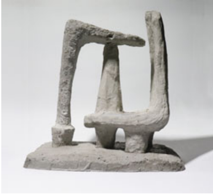
Olga Jevrić, Proposal for Monument – Milanovac , 1954, cement, 40 x 35 x 30 cm.

as a reason for creativity. Our echoes were not a response to the commission. They arose from the need for catharsis—as a debt to those who are no longer there—as identification through a sign. This moment was the basis for my proposals for monuments” (Majher 2002, 93). For this sculptress, abstraction was not merely a formal device but a rhetorical strategy for war commemoration. By focusing on the spatial experience of the viewer rather than the representation of the human body in sculpture, her abstract forms offered an alternative form of commemoration that avoided pathos and explicit narration. Her approach to memorial sculpture proposed not only an alternative form of commemoration but also a new syntax for the language of sculpture in Serbian and Yugoslav art. The opening up of the compact object, the mass of the monument, and the concentration on the exploration of its interior, which is deconstructed and emptied out in a formal sense, offers a solution to the problem of commemoration in sculpture through void as an adequate form for constituting the memory of war suffering.