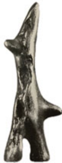
Ana Bešlić, Sketch for Monument I , 1957.