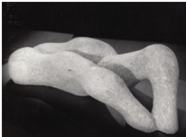
Olga Jančić, Victim III , 1959, plaster, 25 x 84 x 42 cm.

During the same period, she created a series of small-scale sculptures titled Fall (1957) and Victim I-III (1958–59). These works appear as continuation of her